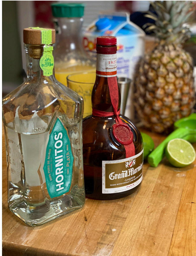
Pineapple Margarita Ingredients

Tequila Salt, for garnish Grand Marnier Pineapple, for garnish Orange Juice Lime Slice, for garnish Pineapple Juice Cherry, for garnish Lime Juice